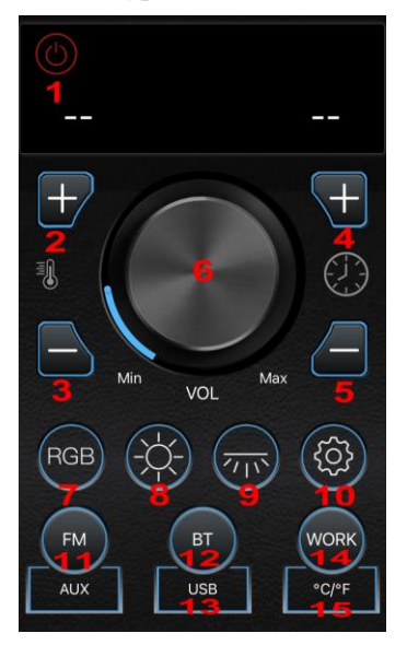
APP Button Instrument Panel

Please refer to the controller operation manual.